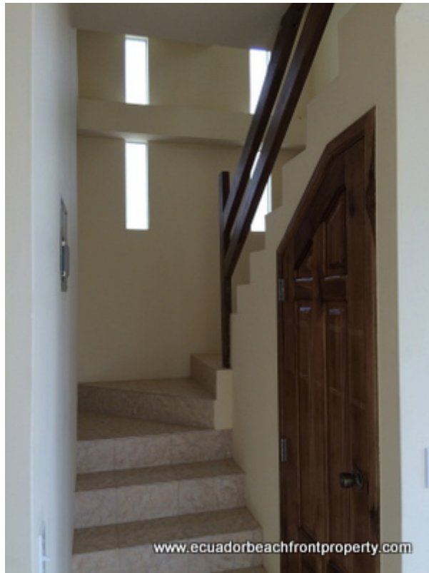
Large windows throughout and glass block up the stairs allow excellent natural lighting