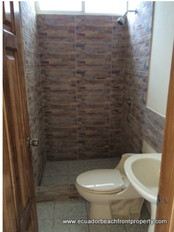
Second bedroom with access to a small oceaview balcony