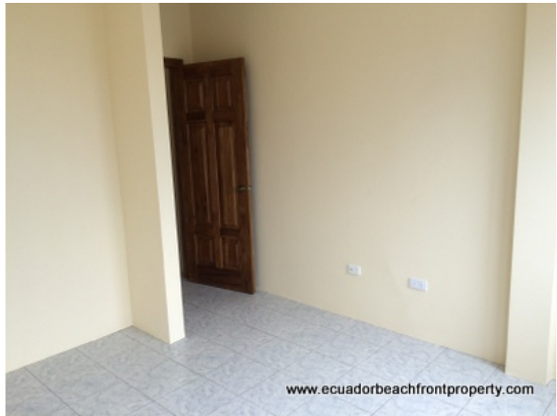
Shared full bath